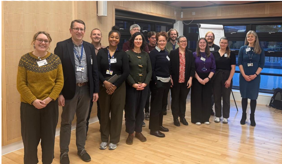
Members of the Scotland's Land Reform Futures Symposium organising team

The event presented several key learning points. Presenters emphasised the importance of robust land data and transparency around land ownership for responsible land reforms and governance. Participants were inspired by the opportunities for the public sector and local authorities in supporting transformative change. Finally, the value of having participants from multiple sectors and locales was greatly appreciated for the rich learnings and prospects of future collaborations.