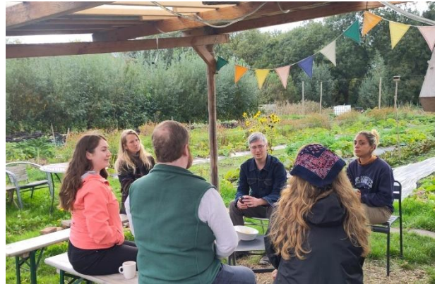
Lutkemeerpolder CSA Farm