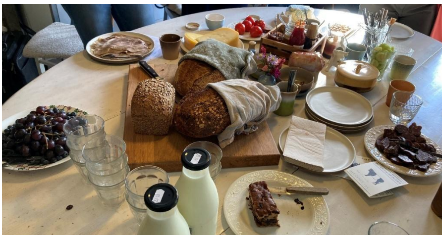
Lunch at Boterhuispolder Farm

The Stakeholder Advisory Group members also felt that it was interesting to discuss Scottish land issues with non-Scottish audiences, with the concept of community land ownership and the role of land commissions being a key point of interest. It was reflected by the Stakeholder Advisory Group members that these may be things that we in Scotland take for granted.