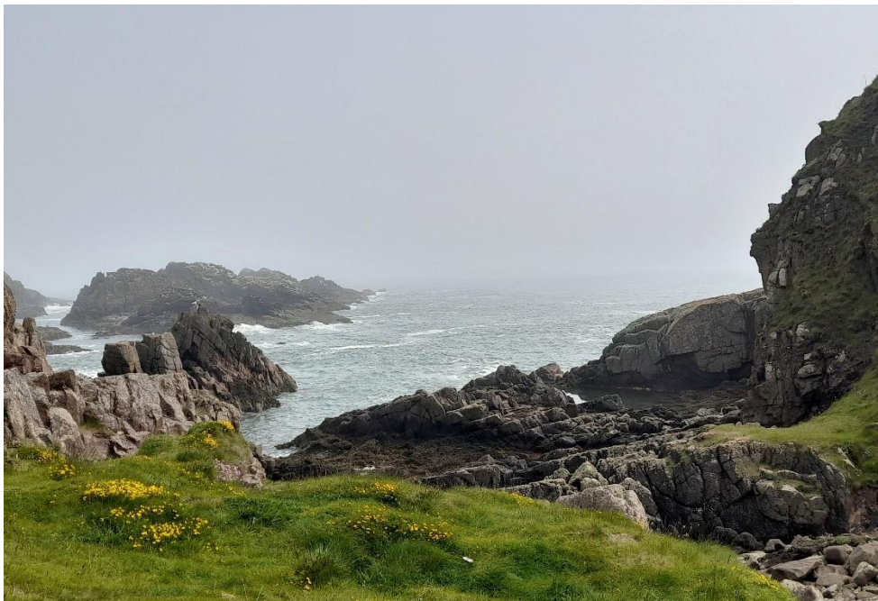
Cruden Bay, Scotland.