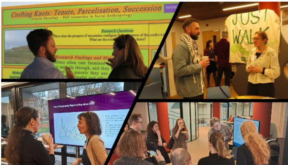
Snapshots from the Marketplace