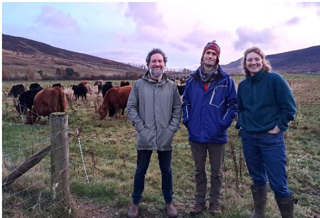
Rottal Estate field trip

On the 10 th of November 2025, two of the research team members accompanied two Symposium presenters from France and Canada on a field trip to Rottal Estate in the Angus Glens, Scotland. Rottal is a mixed upland estate of about 3,000 hectares focused on biodiversity protection, traditional land uses, and environmental restoration.